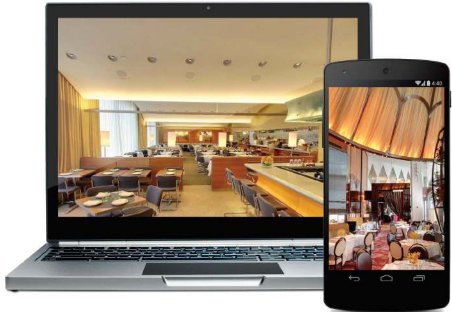
Tour business interiors with Google Maps Business View on desktop, mobile, and tablet devices