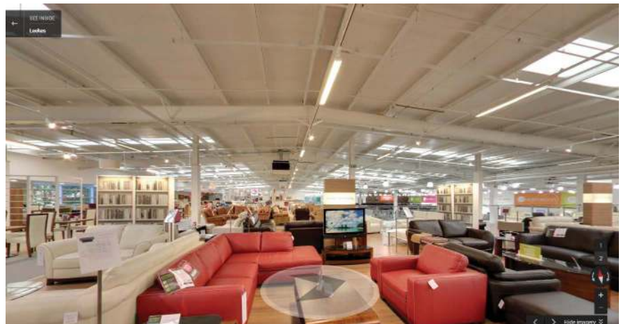
Business View in the Leekes Coventry store.